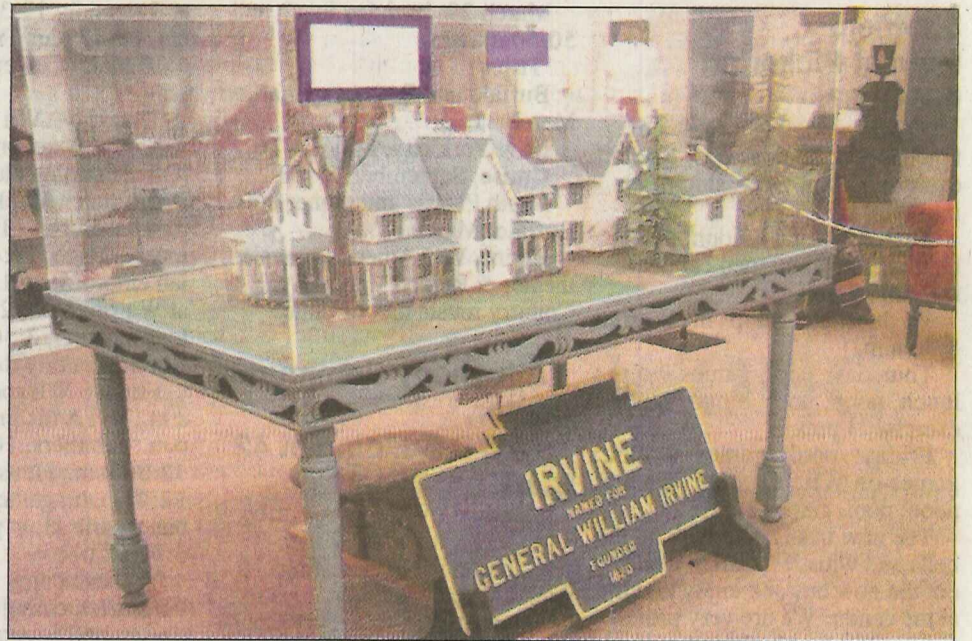
The "Irvine" sign at the Wilder Museum

Only 600 or so Keystone Markers remain of what were originally tens of thousands once found all across